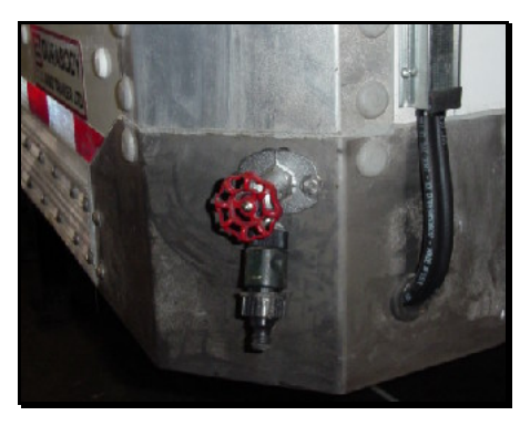
Mist Tank refill Spigot

The mist tank requires filling when empty. Actual time of mist operation will determine the time required to empty the mist tank. The tank should be refilled prior to loading an empty truck. A spigot is located outside of the front of the unit on the passenger side to fill the mist tank. Attach a water hose and fill the tank. Water will flow out of an overflow hose (and onto the ground) when the tank is full. Additionally, there is a cap on the tank to permit the addition of ice to the water if required.