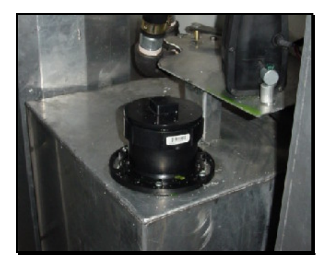
Mist Tank located inside control compartment.