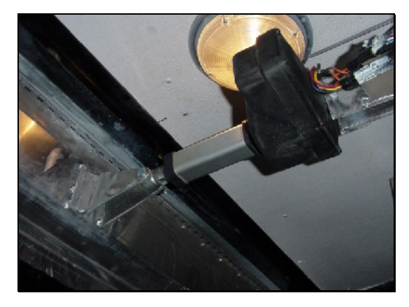
Damper with actuator - interior view