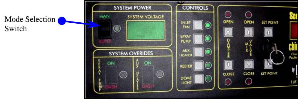
Control "Dash" Panel

The control has two modes of operation: AUTO and MANUAL. Selection Between modes is done on the Dash Panel (see photo below).