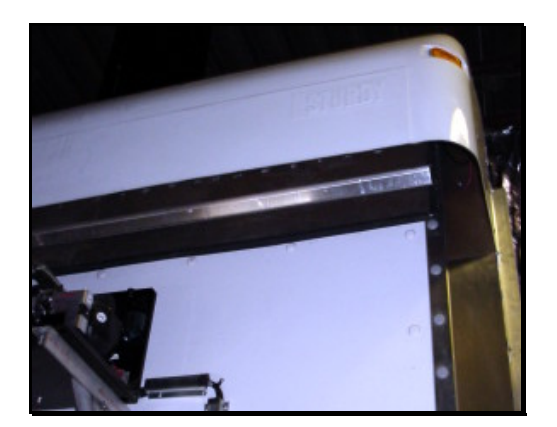
Damper - exterior view

The damper is the top/front intake baffle door which regulates the amount of fresh air allowed into the cargo area. Side baffle doors are connected to the top/front by rods so they open and close at the same time. The side doors regulate the amount of exhaust from the cargo area. The damper is operated by an actuator. As the damper opens, more fresh air is brought into the cargo area and more air from the cargo area is exhausted to the outside. As the damper closes, less fresh air is brought into the cargo area is re-circulated. When the control is on 'auto' the damper will not close less than a minimum specified setting (ie., 10%) to ensure oxygen requirements are maintained. When operating in Manual Mode, DO NOT under any circumstances operate the vehicle with the damper closed below 10% when the box contains chicks.